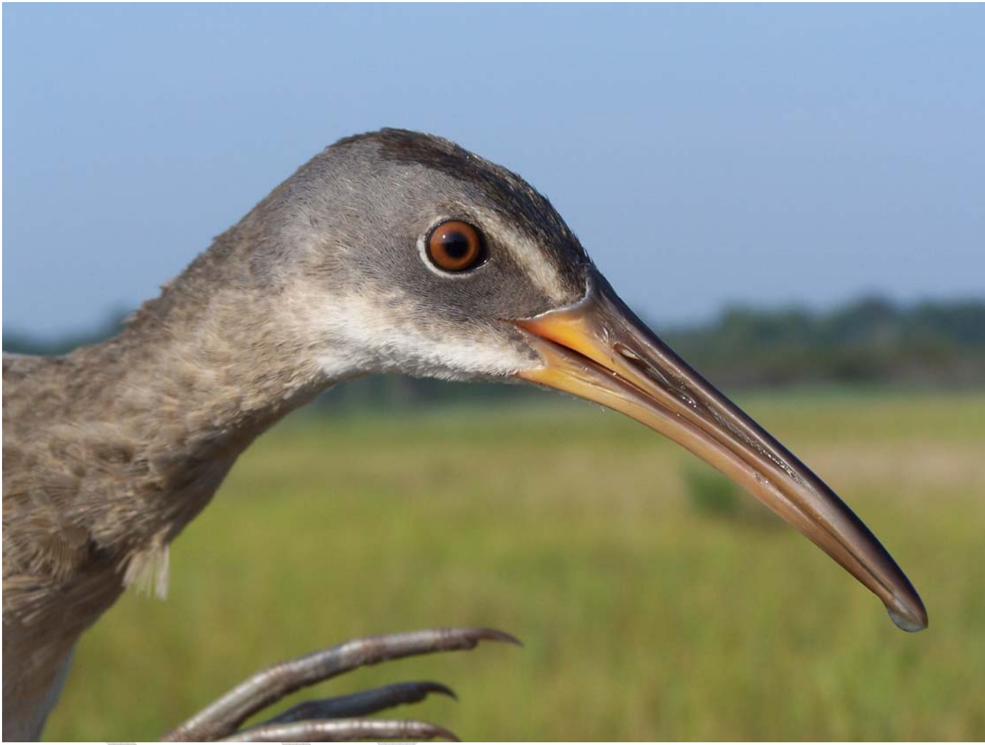
Clapper Rail

Protocol and Standard Operating Procedures for Monitoring Tidal Marsh Birds in the Bird Conservation Region 30